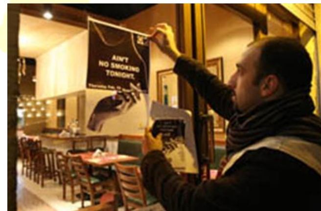
Smoke-free pubs (Gemmayze)