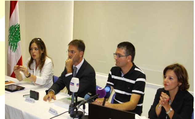
Rebuttal by AUB and TFI