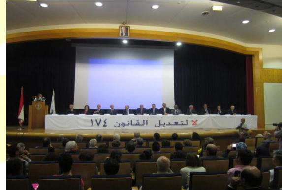
Press conference against any amendments