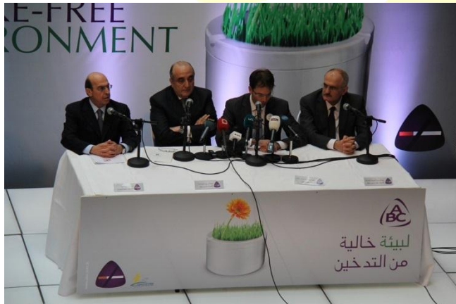
Smoke-free mall (ABC)