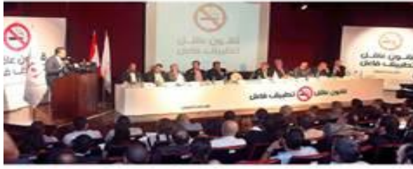
Press conference for the amendment of the law